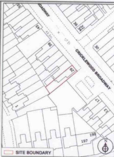
Location Plan (1:1250)

LEASE PLAN 29 CRICKLEWOOD BROADWAY LONDON NW2 3JX